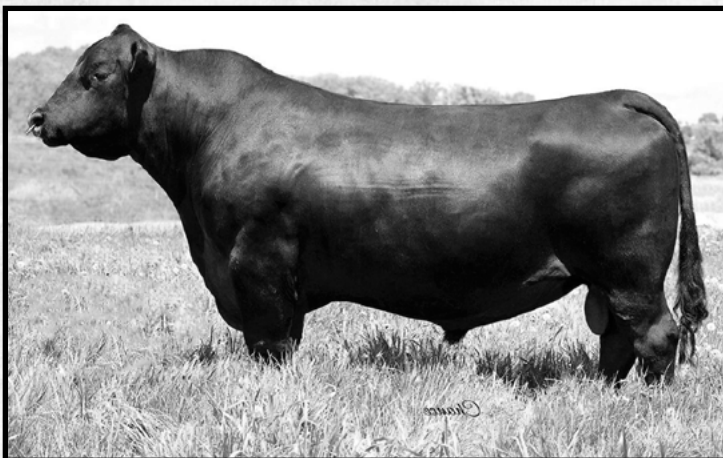
Jindra Acclaim - Sire of Lots 1-3

Redemption is a bull that is going to see a lot more use in our program, we only had 2 bulls this year. The other one was the 2nd high seller in the ND State Angus Sale, we think this one looks just like him.