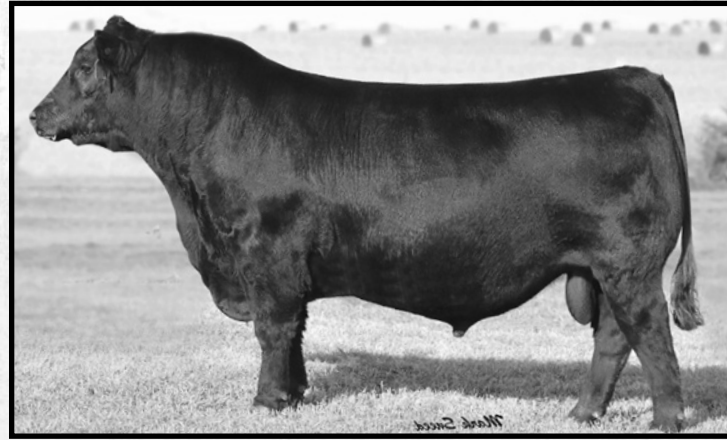
Kramer's Apollo 317 - Grandsire of Lots 8-11