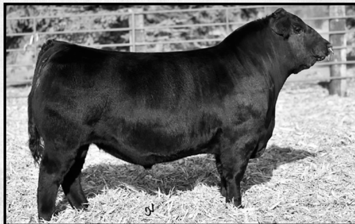
Chestnut Asset 187 - Sire of Lots 12-17.

Here is a lighter birthweight son of Asset from the Grace cow family.